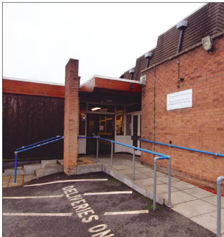
The existing Wingerworth Parish Hall which the Parish Council wants to replace

At the beginning of September, the council held its annual Flower and Produce Show; once again this proved to be a great success with entries almost doubled.