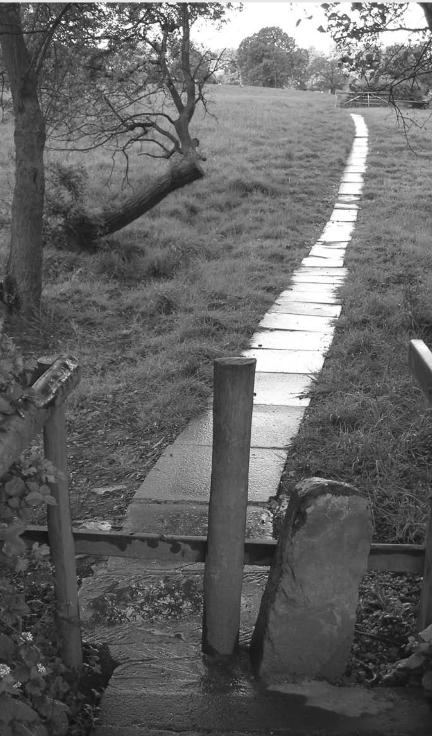
Footpath improvement at the Lavender