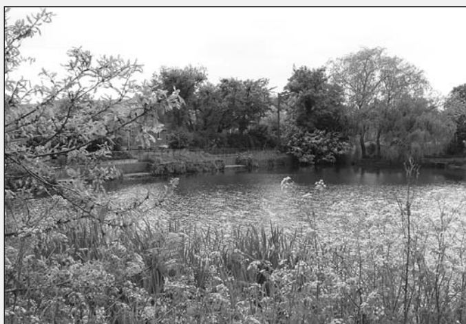
The Lodge Pond provides a peaceful fishing spot

A network of 40 footpaths across the Parish, largely maintained by volunteers and supported by the Council, offers a variety of wonderful walks and provides a route for an annual fell race – the five mile Wingerworth Wobble.