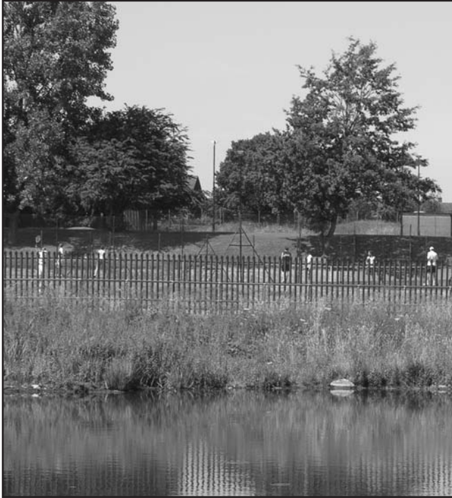
Picture illustrating of the range of outdoor activities offered by the Parish Council with fishing in the fore at the Wall Pond beyond which is the bowling green, the tennis courts and a football pitch.

OVER the past couple of years the Council has been committing more resources to caring for the environment. The Council pays for the provision and servicing of an increasing number of litter bins and dog bins throughout the Parish and the Council has negotiated a contract with Tates Lateshopper to clear litter from the front of the shopping complex at Allendale Road.