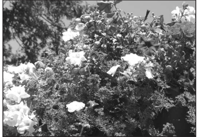
One of the hanging baskets comprising this year's floral display in Wingerworth.

The Council is proud to be your Council, is keen to listen to you and always seeks to do what is best for Wingerworth.