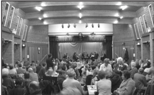
A packed Parish Hall for the Council's annual Christmas event

THE operation and maintenance costs of the Parish Hall is the Parish Council's major area of expenditure (see page 4 of this report) but the investment does mean that there is a flexible multi-purpose centre at the heart of the community which provides for a host of activities.